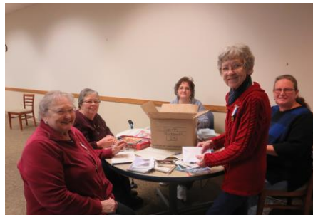
200 Christmas Cards for Holiday for Heroes