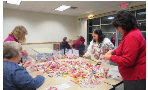
48 Candy Packets for Housing 4 Our Vets Homeless Shelter