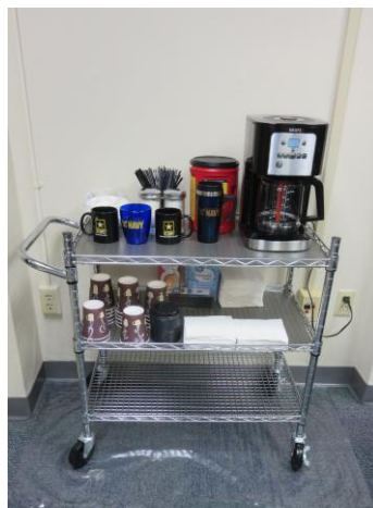
Coffee cart and clock for Veterans Lounge at UW-Whitewater