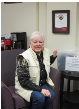
Gloves, hats, socks and scarves for UW-W student Vets