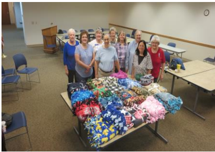
25 Fleece Lap Blankets for Zablocki Medical Center