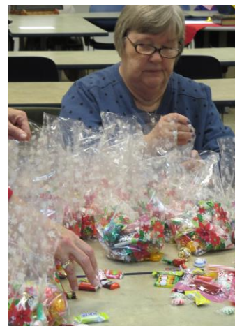
There can never be enough candy!