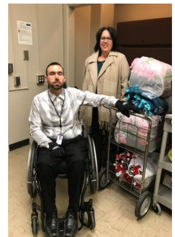
Zablocki Medical Center/Milwaukee Veterans Home